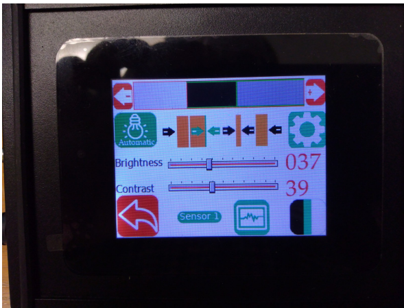
Figure 2. Advanced Sensor Setting Screen