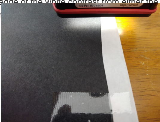
Figure 1. Tracking the Edge of a Contrast

A line used for tracking must have the same color hue and width so that it can be identified by the sensor or camera. The negative space between two rows of labels can be used as a line, as long as the negative space color hue and width remains the same throughout the entire length of the web. Sometimes we might be faced with tracking a contrast that is not defined as a line, such as when the width varies. One such case is when we laminate materials and we are interested in tracking the position of one of the materials. The example below shows two materials that contrast in color, black and white. This can be any color contrast as long as it is visible to the naked eye. We have several options for tracking the web. We can track the left edge of the white contrast from either the left side or the right side of the white contrast, or we can track the right edge of the black contrast from either the left side or right side of the black contrast.